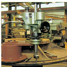
Drilling and boring utilising Morse taper boring bar.