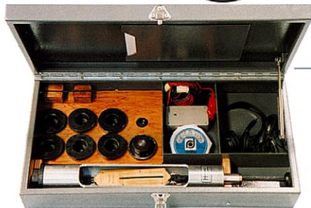
Storage and carrying box – 20 kg. total weight incl. box Size - 380mmW. x 725mmL. x 140mmH.

J. & E. HOFMANN ENGINEERING PTY. LTD. A.C.N. 008 802 211 3 Alice Street Bassendean Perth, Western Australia 6054 Telephone +61 8 9279 5522 Facsimile +61 8 9279 9386 Internet www.hofmann.net.au Email mail@hofmann.net.au