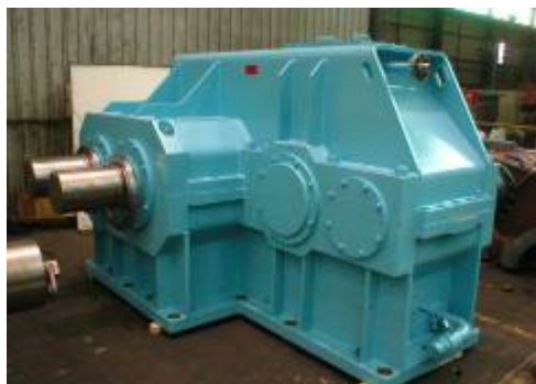
DOUBLE OUTPUT EXTRUDER GEARBOX