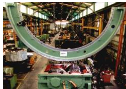
SELF ALIGNING, TWIN PINION MILL DRIVE GEARBOX

Since 1969 Hofmann Engineering has provided specialist engineering services to Australia's industry leaders.