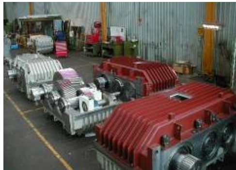
COAL CRUSHING GEARBOXES