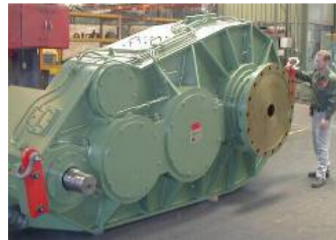
SHAFT MOUNTED ALIGNMENT FREE GEARBOXES